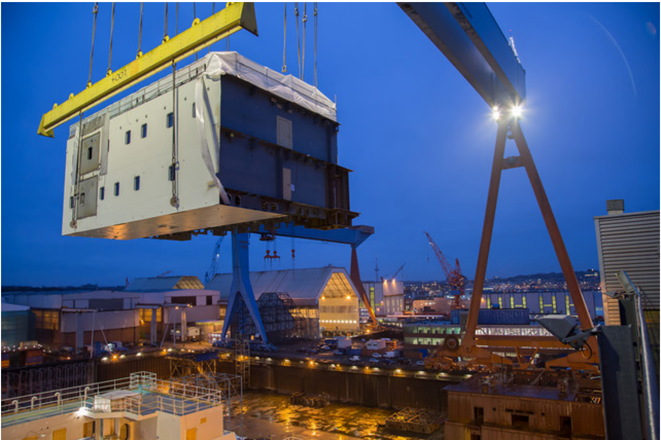
Graphic: accomodation platform DanTysk (Nobiskrug)